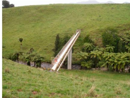
Location photo of a typical aerial river crossing inspected with FOCUS+

The widest of the aerial river crossings inspected was 65 m (213.3 ft) long after which the line entered a buried section. The FOCUS+ five-ring torsional tool was used in this particular case and the results show that the crossing was completely inspected and an additional 20–25 m (65.6–82.0 ft) of the buried and wrapped section.