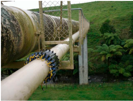
FOCUS+ used to inspect condensate line in New Plymouth, New Zealand

Eddyfi Technologies inspected and assessed the integrity of the aerial river crossings of the 20.3 cm (8 in) condensate line of a New Zealand customer.